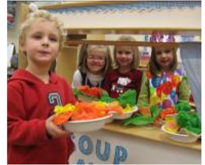
Soup and salad center fun.

We finished our blue month by making blue jello with snow in our sand and water table. It was fun to mix and stir and watch the jello set! It was a yummy month.