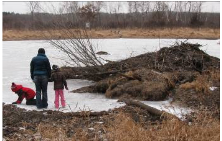
Up close to an active beaver lodge.

Our Kindergarteners have done a great job reading lots of pages! Almost every student read more than 500 pages so they will be receiving prizes from the Timberwolves. The total number of pages read is 32,570! The award ceremony will be in March and we will announce our class winners then. Great job Kindergarteners!