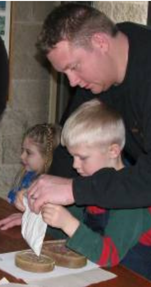
Making footprint molds.