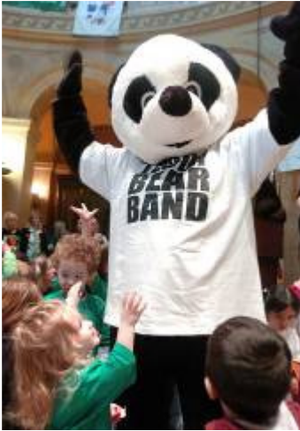
Panda Bear will be here with the band! He is a hit with the kids, so make sure to be here for Family Fun Day!