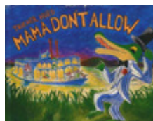
Students will experience this fun musical book!

Sunshine Friday students were selected to be part of Minnesota Orchestra's Kinder Konzerts in April! This is a golden opportunity for our students to hear a concert designed especially for children. Students attending will also be able to actually play a real violin, a drum and a cello!