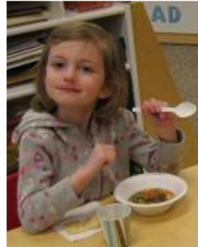
Friday kids made stone soup!